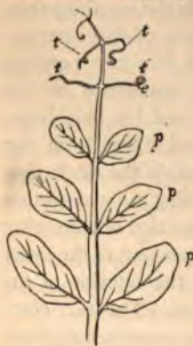
Fig. 7. LEAF OF PEA.

“commonplace of nature.” By way of illustrating the subject of the threadlike “tendrils” of plants presents itself in a prominent manner. It would be hard to discover any organs of plants which are better known than these. Poetic allegory itself has never found in the simile of the “tendrils” the best disguise under which the affections of mankind might be shadowed forth; and that the weak-stemmed plants climb by the aid of these organs is not a matter requiring even a primer of botany for verification. Now, plants of very varied nature possess these organs; and the question arises, are these tendrils new and special organs in such plants, or are they but modifications, like the home of the Tortoise, of familiar structures? Let the science of likenesses reply, by directing our attention to the general form of